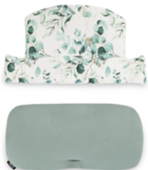
HIGHCHAIR PAD BACK & SEAT PADS FROM 6 MONTHS