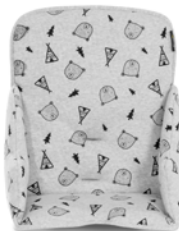
ALPHA COSY SEAT REDUCER FROM 6 MONTHS