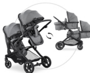
CONVERTIBLE SEAT UNITS

Your babies will be comfy and snug in the carrycot. As soon as they can sit, they can start using the sports seat. It has an adjustable backrest. They can nap when they need to.