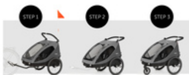
FROM BIKE TRAILER TO BUGGY