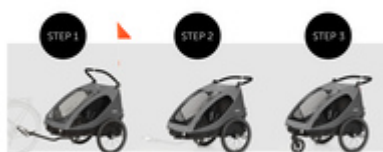
FROM BIKE TRAILER TO BUGGY