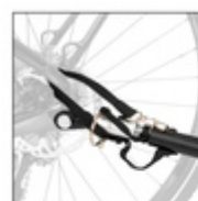
EASY FIXATION TO BIKE

The Dryk Duo is very easy to install to your bike. The drawbar has its own storage bag. It can be coupled easily and securely to the bike trailer and your bike thanks to the double safety system.