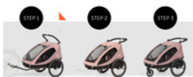
FROM BIKE TRAILER TO BUGGY