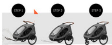
FROM BIKE TRAILER TO BUGGY