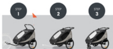
FROM BIKE TRAILER TO PUSHCHAIR