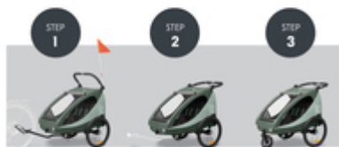
FROM BIKE TRAILER TO PUSHCHAIR