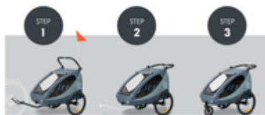
FROM BIKE TRAILER TO PUSHCHAIR

Are you out and about a lot, and you need a bike trailer that easily transforms into a pushchair? And which you can quickly attach to your bike? Then the Dryk Duo Plus is perfect for you.