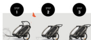
FROM BIKE TRAILER TO PUSHCHAIR OR SPORTS MODE