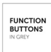
FUNCTION BUTTONS IN GREY