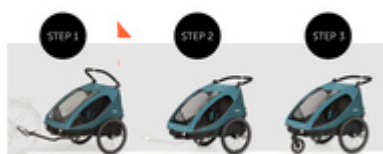
FROM BIKE TRAILER TO BUGGY