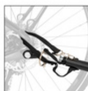
EASY FIXATION TO BIKE

The Dryk Duo is very easy to install to your bike. The drawbar has its own storage bag. It can be coupled easily and securely to the bike trailer and your bike thanks to the double safety system.