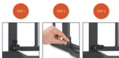
SAFETY GATE OPENS IN BOTH DIRECTIONS