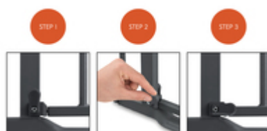
SAFETY GATE OPENS IN BOTH DIRECTIONS