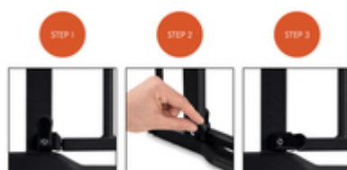
SAFETY GATE OPENS IN BOTH DIRECTIONS