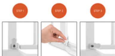
SAFETY GATE OPENS IN BOTH DIRECTIONS