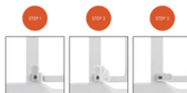
SAFETY GATE OPENS IN BOTH DIRECTIONS