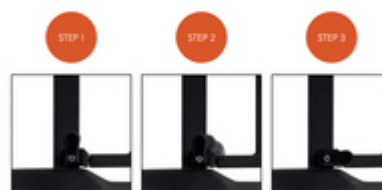
SAFETY GATE OPENS IN BOTH DIRECTIONS