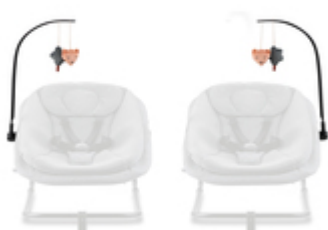
CAN BE USED ON BOTH SIDES